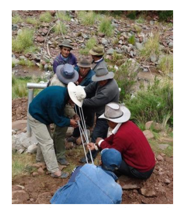
Men in Palcoma Baja working on their water project.